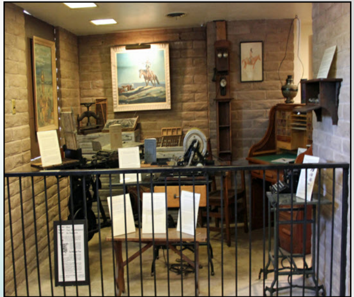
Gunpowder Press office exhibit at the museum at Tubac Presidio State Historic Park.