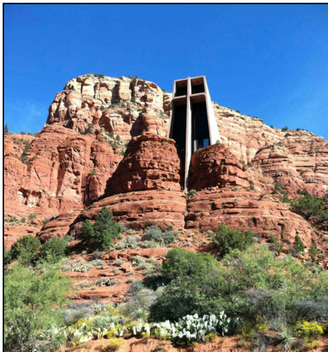
Visit Sedona's Redrock Chapel during the pretour.

Sun., Sept. 23-25: Southern AZ Post-Tour. Visit Mission San Xavier and the Tubac artists' community.