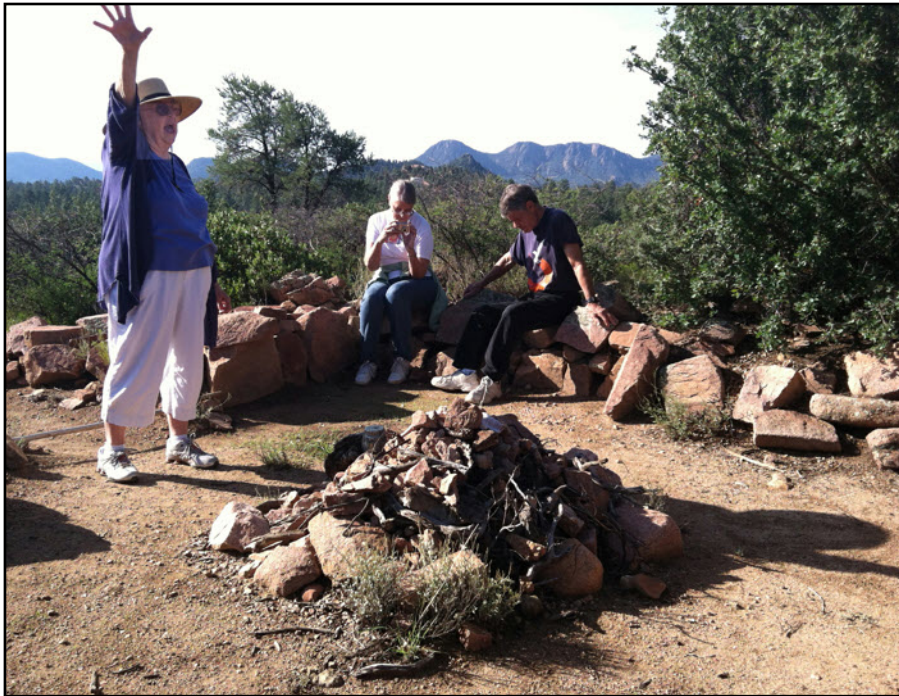
Attendees of last year's Rim Country retreat at The Merritt Center enjoyed early morning "sun hikes."