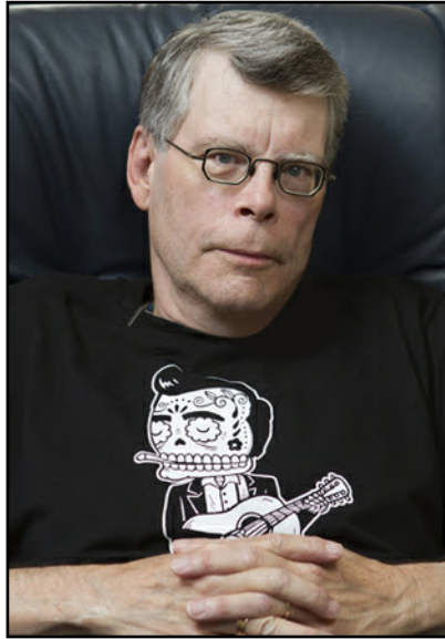
Stephen King