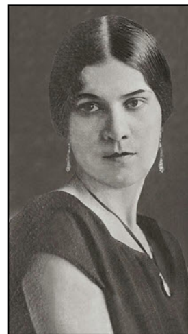
Olgivanna Lloyd Wright

with people who knew Wright. In addition to the role she played in her husband's success, Wright wrote a newspaper column about life at Taliesin and authored several books, including The Struggle Within , Roots of Life , and Frank Lloyd Wright: His Life, His Work, His Words .