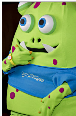
Story Monster will visit the Payson Book Festival

Payson Book Festival from 9 a.m. to 4 p.m. on July 25 at Gila Community College, 201 N. Mud Springs Road in Payson. This family oriented, free event features food, entertainment, workshops and storytime for kids, who can also meet Five Star Publications' Story Monster (costume character). The goals of the festival are to promote literacy and showcase Arizona authors.